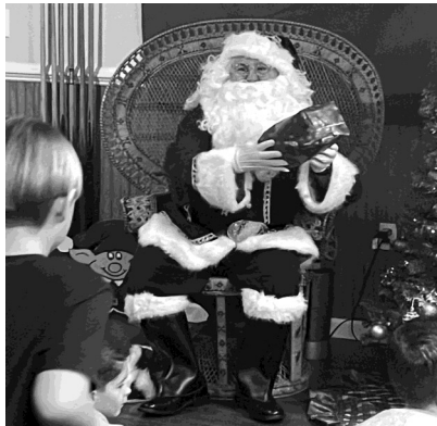
SANTA at KIDS PARTY