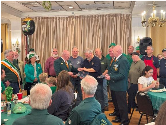
After the 2025 St, Patrick's Day Parade in Freehold, Irish Dignitaries from Dublin, Ireland presented Freehold 1672 Council a Certificate of Appreciation for our support of the parade over the years!

St Patrick's Day 2025 Brother Knights waiting for the 50/50 Drawing for the Columbian Club of Freehold 1 st Prize winner $5,808.00 2 nd Prize $1,161.60 3 rd Prize $290.40 Congratulations to all!